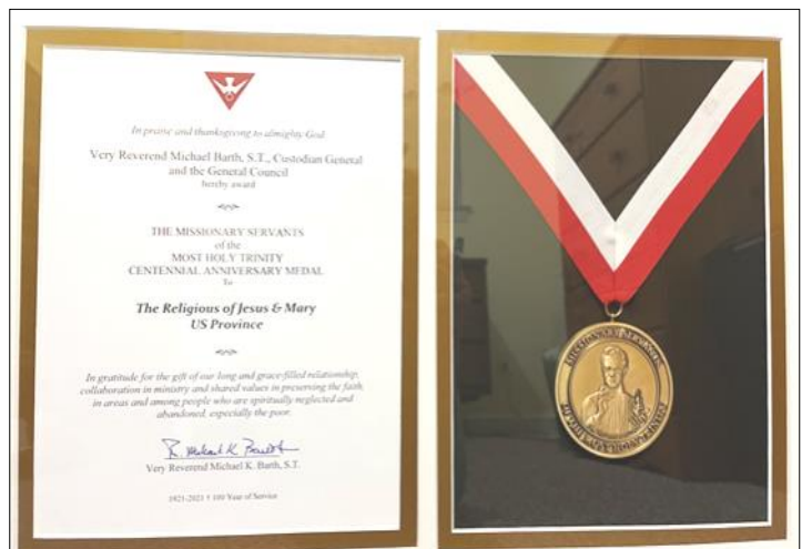
The accompanying certificate reads: In gratitude for the gift of our long and grace-filled relationship, collaboration in ministry and shared values in preserving the faith in areas and among people who are spiritually neglected and abandoned, especially the poor.