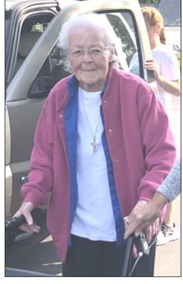
The food was good and plentiful, including a special cake!