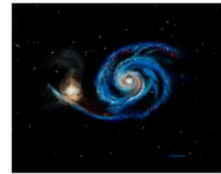
Hope for the Earth. Hope for Humanity May 21-28, 2023 A Contemplative Guide to Laudato Si' Week 2023

There is no question that Laudato Si' issues an urgent call to action in response to the cry of Earth and the cry of the poor. But our action, to be effective and appropriate, must be rooted in a profound conversion of heart and mind. You are invited during Laudato Si' Week 2023 to a daily period of contemplative prayer. If you can, pray outside. Begin your prayer by becoming aware of your place in the communion of Creation. Press your feet into the ground. Become conscious of your breathing. Feel the sun or the breeze on your skin. Listen for the voices of other creatures. When you feel centered, read the daily quotes from Laudato Si' and from other authors. How do they relate to each other? Pick a word or phrase that has an attraction for you. Let that word draw you into silence. Dwell there for a while. What call did you experience in this time of contemplative prayer?