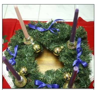
La Casa de Esperanza San Diego, CA