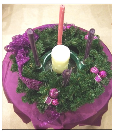
St. Timothy Mission Center Warwick, RI