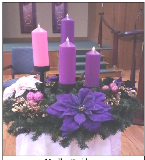
Marillac Residence Wellesley Hills, MA