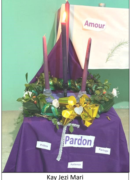
Gros Morne, Haiti