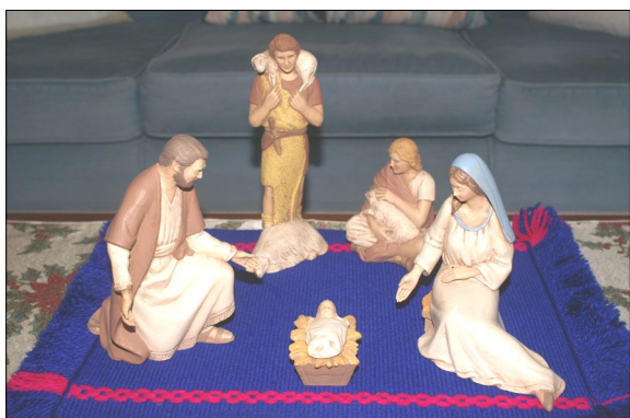
La Casa de Esperanza San Diego, CA