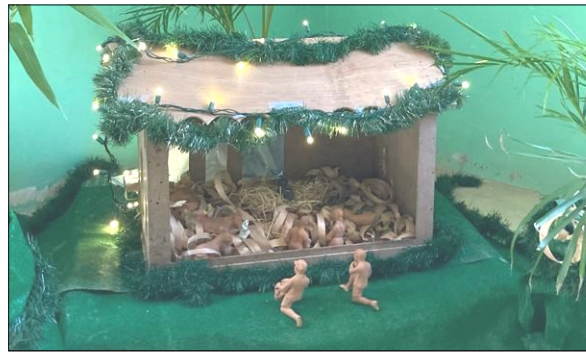
Kay Jezi Mari Gros Morne, Haiti