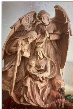
Chez Claudine Plainville, MA