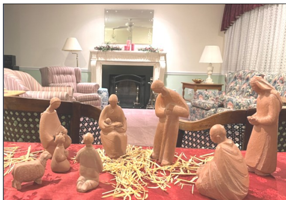
University Park Community University Park, MD