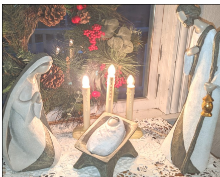
Thevenet House Highland Mills, NY