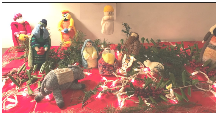
13th Street Community Washington, DC