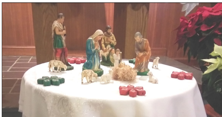
St. Timothy Mission Center Warwick, RI