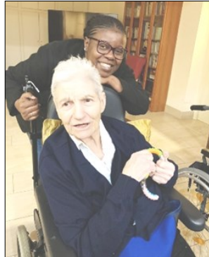
Experiences in infirmaries of the Province of Spain (on left, in Barcelona)