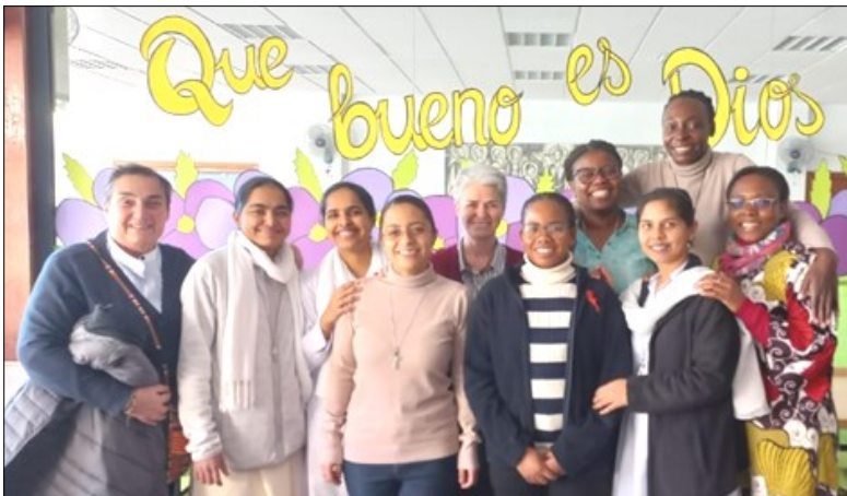
Workshops and training spaces (above):

JPIC Diploma (Justice, Peace and Integrity of Creation)