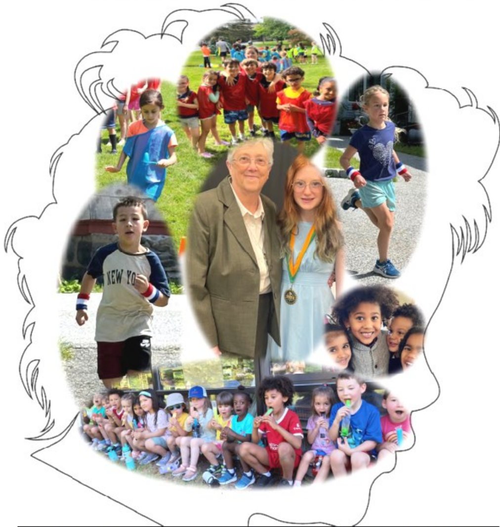
The end of the school year proved an exciting time for the children at TMS. Students participated in a Mile Run, enjoyed an Ice Cream treat from the "Ice Mother", supported their departing friends at Graduation, competed in Field Day games, celebrated the last day of school for the 2023/2024 academic year, and began the Summer Enrichment Program the following Monday. The Thevenet adults are still trying to catch their breath from all these activities!