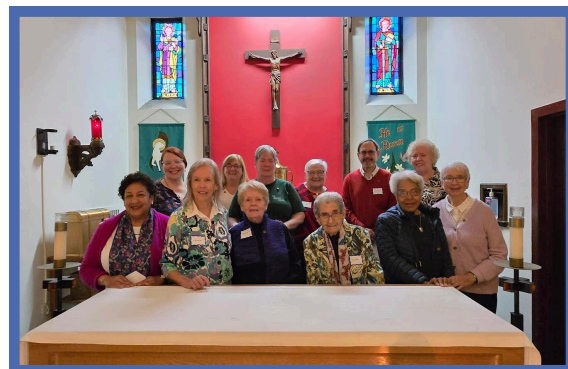
AFJM members following recommitment ceremony.