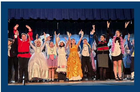
Some of the performers in Beauty and the Beast from St. Frances de Chantal School.

St. Frances de Chantal School in New York put on a wonderful performance of Beauty and the Beast . From the performers to the costumes, the production was amazing to watch. We are incredibly grateful to the students, directors, staff, and volunteers whose hard work and commitment brought this story to life. We would also like to extend our sincere thanks to the families and community members who supported the production and helped make it such a memorable success.