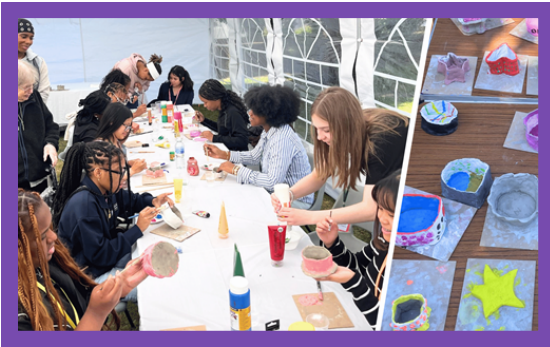
Depicted are the girls working on their pots.