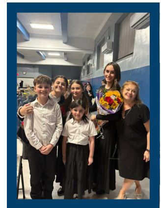
Performers in the production with the adults who helped make this story come to life.

St. Frances de Chantal School in New York put on a wonderful performance of Beauty and the Beast . From the performers to the costumes, the production was amazing to watch. We are incredibly grateful to the students, directors, staff, and volunteers whose hard work and commitment brought this story to life. We would also like to extend our sincere thanks to the families and community members who supported the production and helped make it such a memorable success.