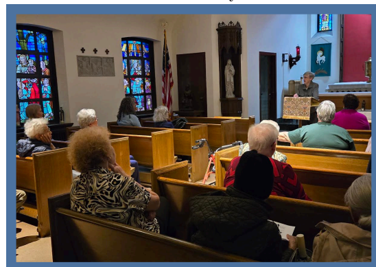
The presentation took place in the chapel of the former convent.