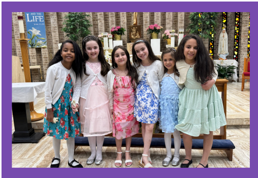
Depicted are some of the 2 nd graders who celebrated their first reconciliation.

The second graders in New York recently received their first reconciliation and will soon be receiving their first communion. We are very excited for these second graders to be taking the next steps in their faith journey.