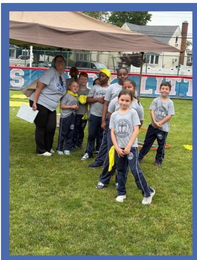
Depicted are the kindergarten class after playing with water balloons.

The students at Saint Francis de Chantel had a field day this week filled with excitement, laughter, and school spirit. To celebrate the end of the school year, students participated in a variety of fun outdoor activities and games throughout the day. Students from all grade levels had the opportunity to join in the events and spend time together enjoying the beautiful weather. One of the highlights of the day was a water balloon activity that helped everyone cool down and added even more fun to the celebration. It was a wonderful way for students and staff to come together and end the school year on a positive and memorable note.