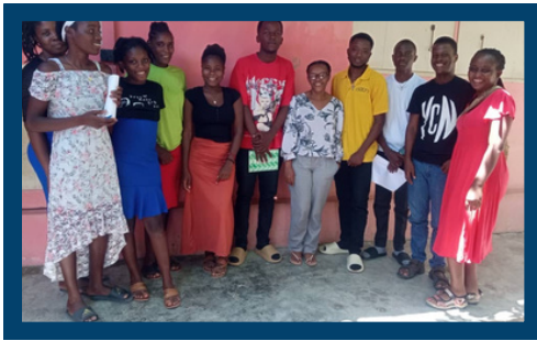
Depicted are the participants of the RJM Jean Rabel Team.