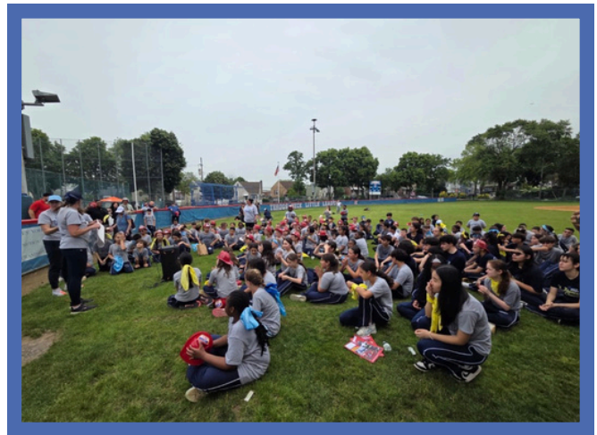
Depicted are the 3 rd and 4 th graders.